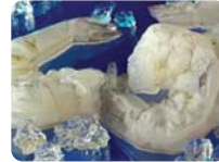
RPDTF Raw, Peeled, Deveined Tail Off