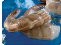
HLSOEZ Head-Less, Easy Peel (shell split down back of shrimp)