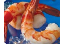
CPDTO Cooked, Peeled, Deveined, Tail On