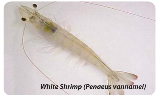
White Shrimp ( Penaeus vannamei )

Feed is made up of 25-35% protein (fishmeal/fish oil), and 65-75% grains, either soy or corn and then trace minerals dependent upon the specific formula.