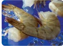
HLSO Head-Less, Shell On