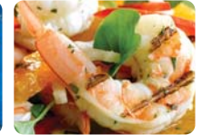
CPDTF Cooked, Peeled, Deveined, Tail Off