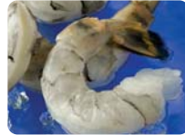
RPDTO Raw, Peeled, Deveined Tail On