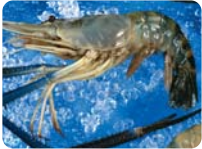
HOSO Head On, Shell On

Shrimp are sized by the number of pieces per pound. Therefore a 16/20 HLSO Shrimp means there are 16-20 shrimp per lb, a 26/30 CDPTO means there are 26-30 cooked shrimp per pound. Most specifications allow for an end-count, which means the average size will range towards the end of the count, ie: 16/20 HLSO Shrimp, the count will average at 19 shrimp per pound.